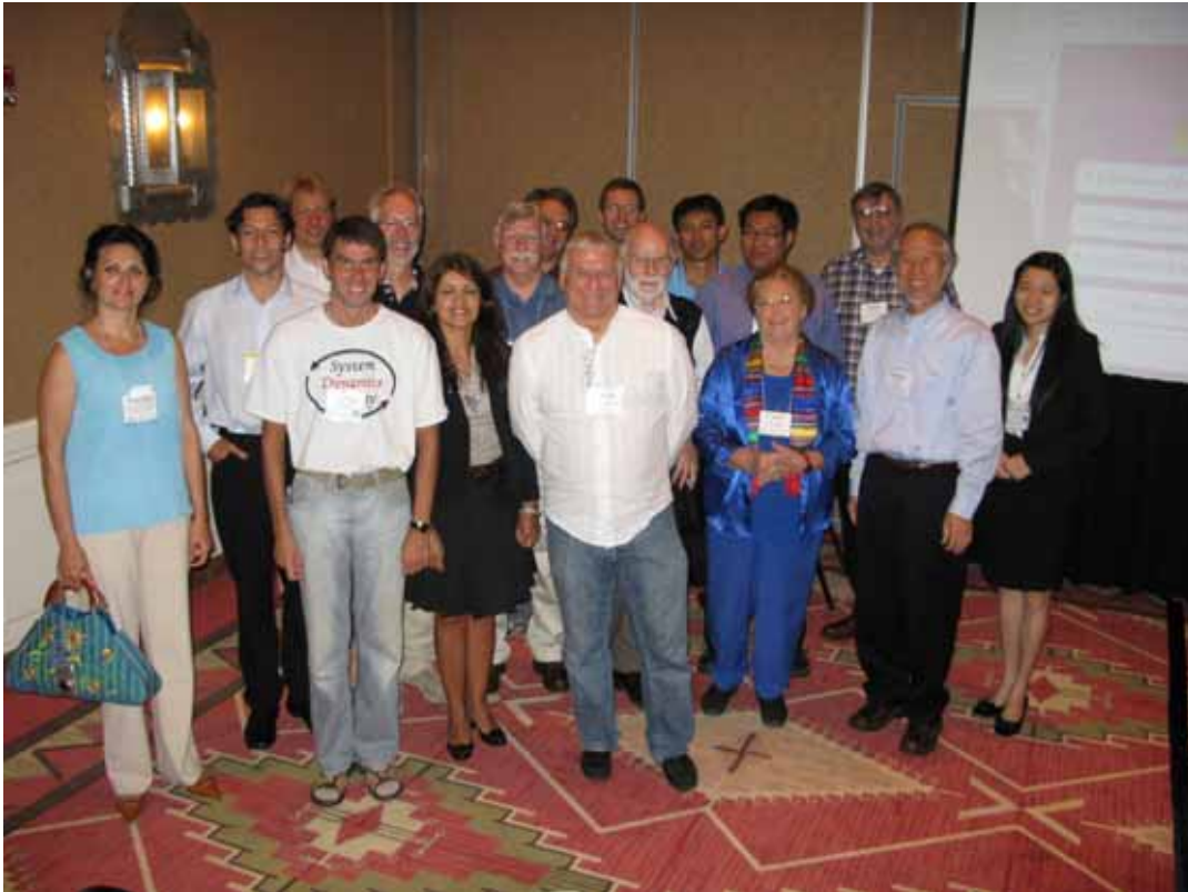
Group Photo of the Economics Chapter Meeting