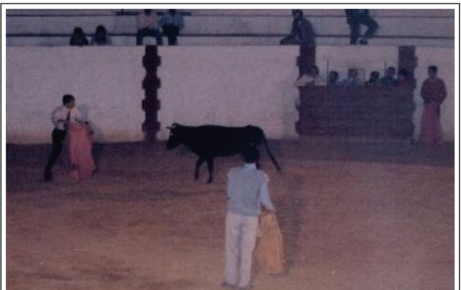
Can you name the “bullfighter” wearing the tie?

If no nominations are received by the Policy Council from the membership at large, the slate of candidates submitted by the Nominating Committee, and recognized and accepted by the Council, will be deemed elected. For more information on Nominations and Elections, please see the Policies of the System Dynamics Society under “Governance.”