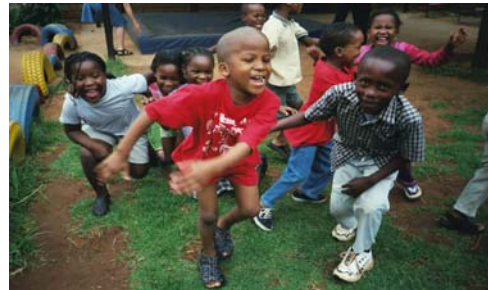
Kids playing in the Sebokeng Township where myclimate supports a project to capture methane and generate clean power in a waste water treatment plant.

Climate change is the environmental challenge number one in the 21 st century. Scientists recommend that not more than 1.5 tons of CO 2 shall be emitted per person yearly to guarantee a stable climate - an amount emitted by an air traveller on a one-way trip from New York to London!